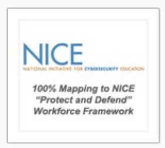
The National Initiative for Cybersecurity Education (NICE)