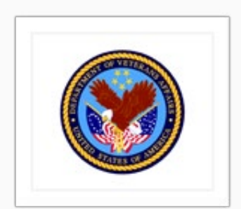
Department of Veterans Affairs